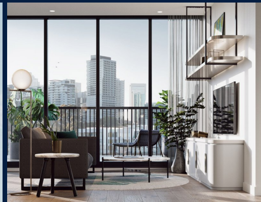
Roden : 3 - Bedroom + Study